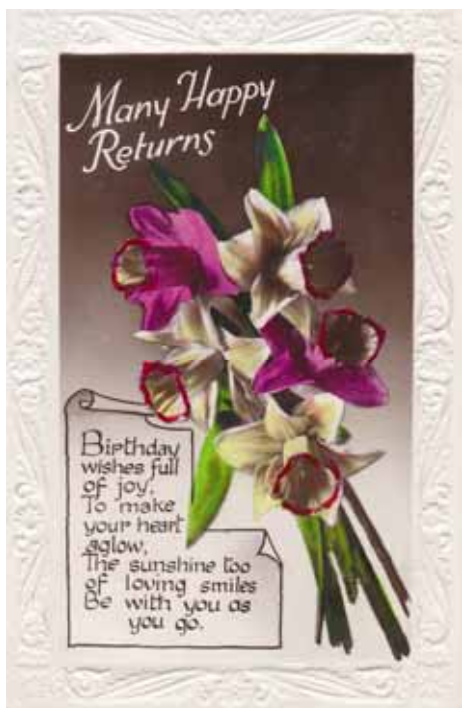
Fig 5 Many Happy Returns - hand coloured.

Roses are probably the most photographed flower on these early greetings cards but there are still plenty with daffodils that are taken from photographs of actual flowers and so help to chart the breeding and development of the daffodil.