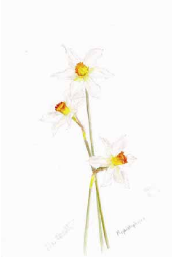
Fig8 Mephistopheles by Nan Heath

Botanical paintings are also much prized to chart the history of the daffodil. Many of these are very stiff and formal as befits the style of a precise record of a specimen. However there is a set of 16 cards painted by artist Nan Heath of the Scilly Isles that is more freely drawn that deserves special mention. Nan Heath (1922-1995) sketched and painted daffodil varieties that grew on the Isles of Scilly carefully recording the name of the variety and reproducing some of their special characteristics of colour, form, texture, size and stem., probably drawn in the field without thought of future publication as a lovingly recorded and useful record for identifying daffodils.