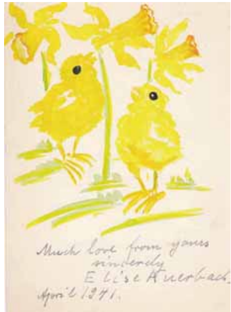
Fig 7 Hand painted Easter card.

There are also some beautifully reproduced daffodil postcards from artist's paintings ranging from Dutch masters to modern day artists. I am particularly fond of home produced cards where a daffodil likeness has been painted onto a greetings card. Some of these have a photograph of the sender looking very serious. Like all daffodil artefacts there are some 5, 7 and 8 petalled examples!