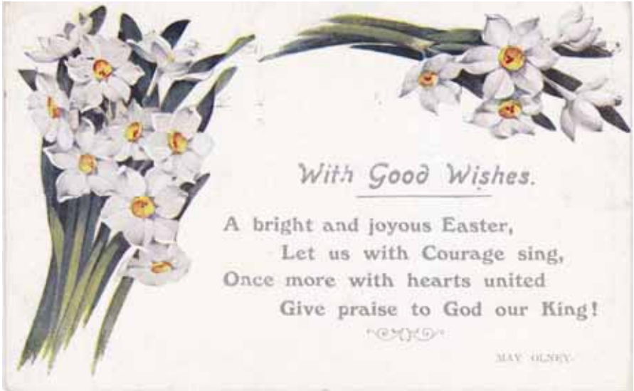
Fig 6 With good wishes

There are also some beautifully reproduced daffodil postcards from artist's paintings ranging from Dutch masters to modern day artists. I am particularly fond of home produced cards where a daffodil likeness has been painted onto a greetings card. Some of these have a photograph of the sender looking very serious. Like all daffodil artefacts there are some 5, 7 and 8 petalled examples!