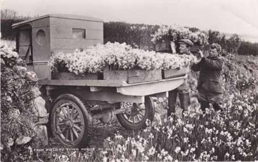
Fig 2 From field to tying house

Despite the daffodil being a national emblem of Wales the daffodil does not feature on many Welsh cards and I have but one depicting naturalised plantings of the Tenby daffodil. Northern Ireland with a long history of producing quality daffodils appears to have few cards. But Scotland fares rather better with some fine plantings in castle grounds although more of the Brodie of Brodie's daffodils would be welcome.